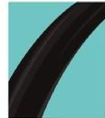
LOW POROSITY tightly closed