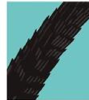
MEDIUM POROSITY slightly opened, not closed