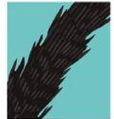
HIGH POROSITY wide opened cuticles